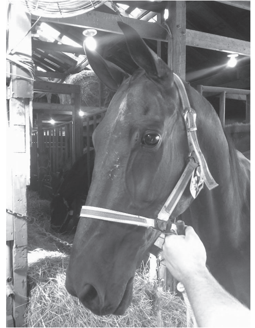
One of the six rescued believed to be, Kiss My Match, Mollie Muggins, Keylarkgo Blue, Marios Kick Start, SOS Crusader, and Bedarka.

Key Larkgo Blue ( tattoo still not confirmed as his legs prove years of racing and his card shows no racing lines)